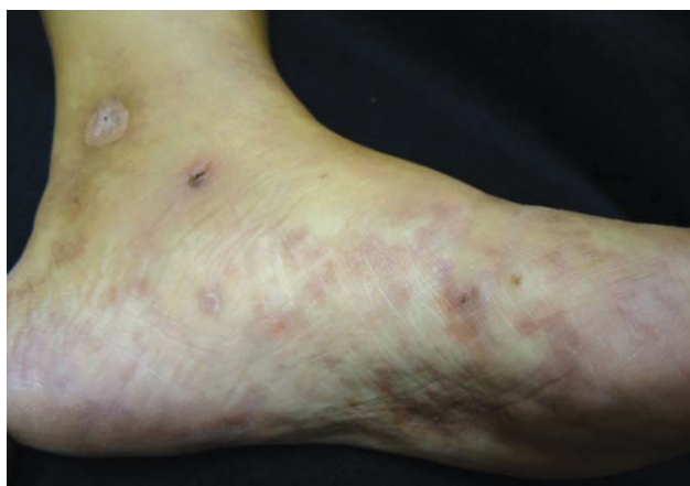
FIGURE 2: Reticulated erythematous-violaceous patches on the left foot and an ulcer in the left medial malleolus