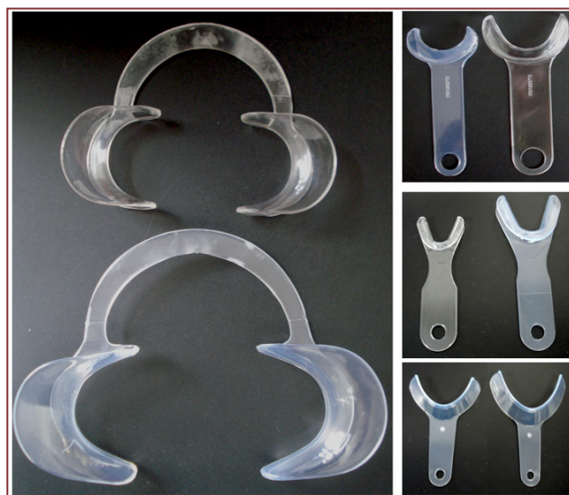
Fig. 2. Lip retractors with specific sizes to adults and children.

The JPEG (joint photographic experts group) format is the most widely used for storage of digital images, with a high resolution and low size, without loss of quality. This format is also recommended for clinical cases to illustrate academic presentations in PPT or Keynote. For publication purposes, the format TIFF (Tagged information file format), with high resolution and relatively large size, is the most requested by magazines and dental journals [12].