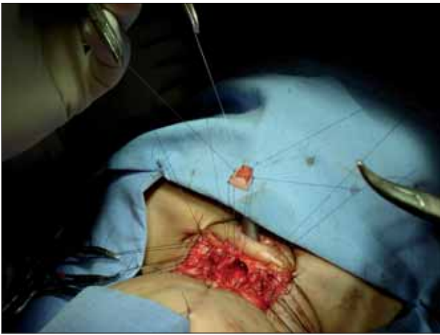
Figure 1. Placed on the suture costal cartilage graft and the posterior wall of the cricoid (laryngofissure later), before the definitive positioning of the graft. Note that the endotracheal tube, placed in the tracheostoma, below the area of stenosis.