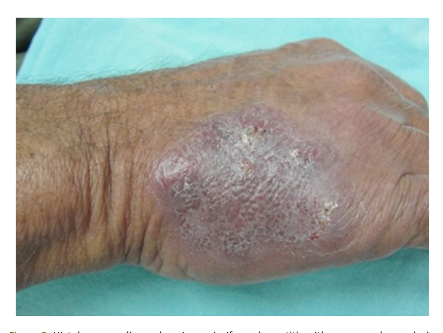
Figure 2: Histology revealing a chronic psoriasiform dermatitis with verrucous hyperplasia, papilar fibrosis and a predominantly eosinophilic and neutrophilic infiltrate.