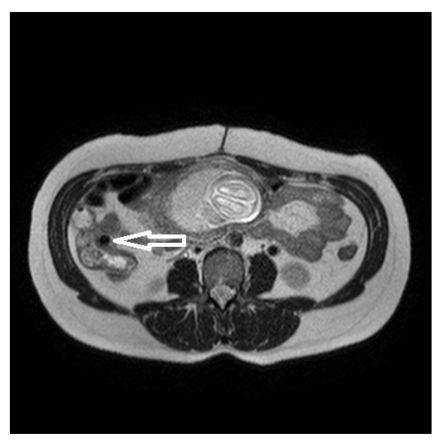
Figure 1: Axial T2WI sequence with fat suppression (spectral attenuated inversion recovery, SPAIR) demonstrating the appendiceal wall at the base of the appendix, with hypointense T2 signals.