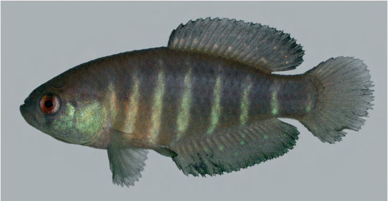
Fig. 1. Austrolebias paucisquama , holotype, MCP 41879, male, 34.2 mm SL, Rio Grande do Sul, São Sepé, temporary pool close to BR290 highway (30°22'27" S 53°33'42" W), rio Vacacaí drainage.