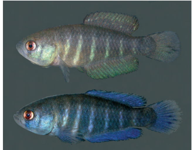
Fig. 2. Austrolebias paucisquama , paratype, MCP 41880, male 25.5 mm SL, Rio Grande do Sul, São Sepé, temporary pool close to BR290 highway (30°22'27" S, 53°33'42" W), rio Vacacaí drainage. Same specimen alive (above) and just after fixation in formalin (below).

Diagnosis. The dark gray pectoral fins combined with the bright blue iridescence in males distinguishes A. paucisquama