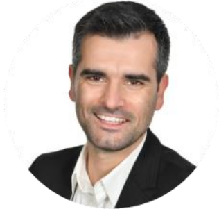
Prof. Elói Figueiredo Lusófona University Portugal

Three decades of pattern recognition for structural health monitoring of bridges