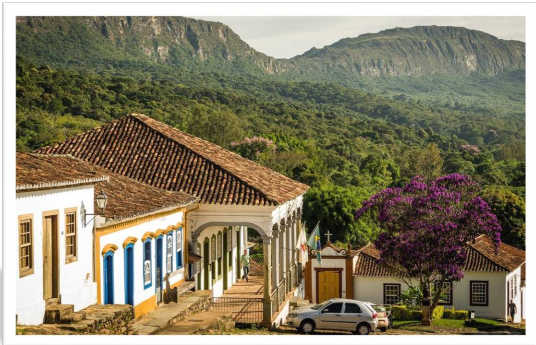
Serra de São José, with a maximum altitude of approximately 1300 m, is located between the municipalities of Tiradentes, São João del-Rei, Santa Cruz de Minas, Prados and Coronel Xavier Chaves.

In this book section, the reader will find a list with all participating institutions (authors' affiliation), a summary with all the titles of published articles, and the schedule for the oral presentations performed at the conference.