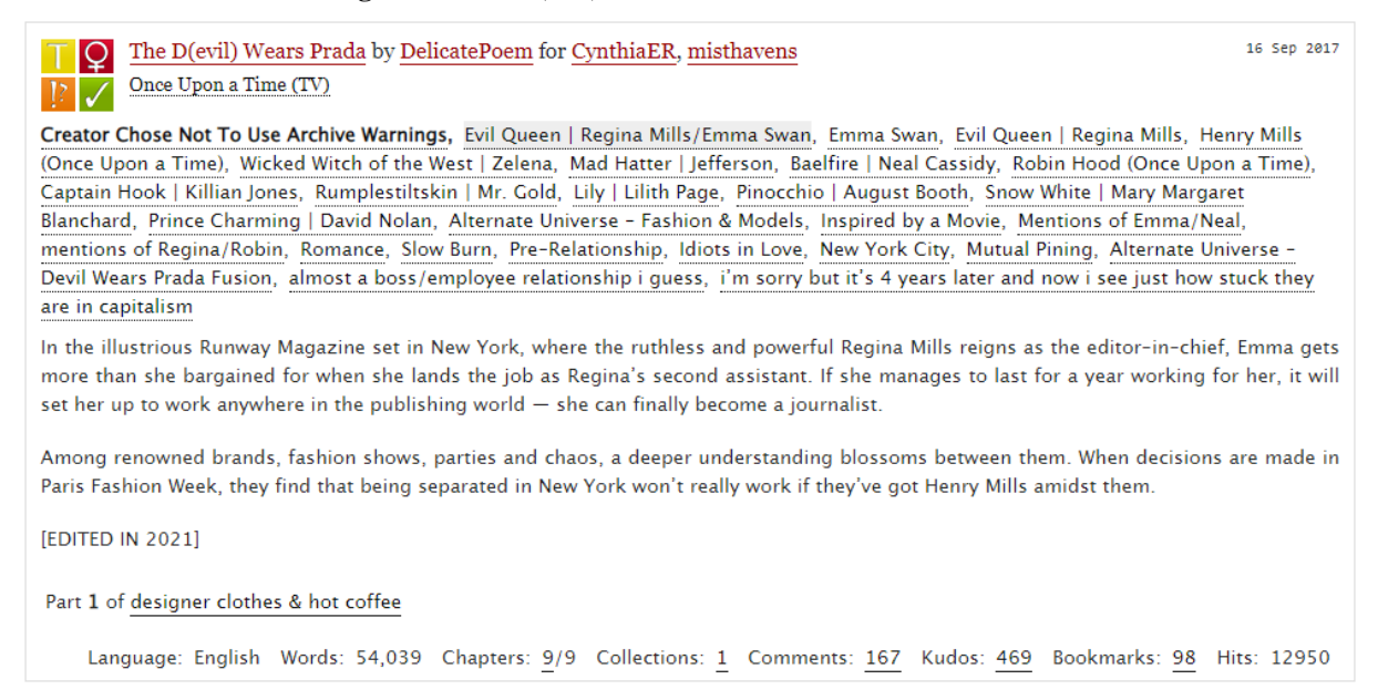
Figure 4 - The D(evil) Wears Prada on Archive of Our Own