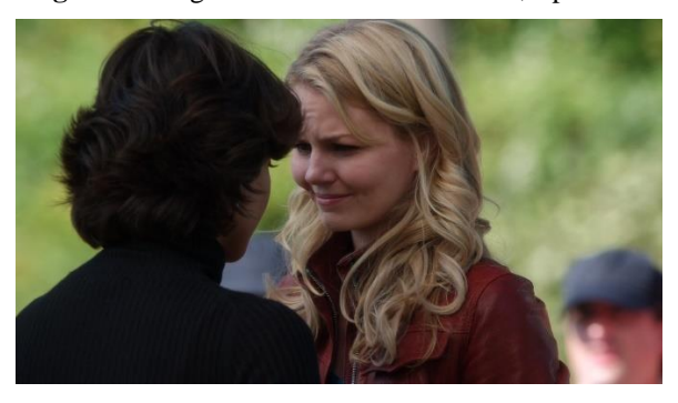
Figure 2 - Regina and Emma in Season 1, Episode 5

Regina and Emma had scenes that showed their love for one another without ever uttering these words – they were willing to sacrifice their own lives for the other repeatedly and wanted to make sure the other would have a happy ending. They would even parallel other heterosexual couples in the series, such as Snow White and Prince Charming. Even before Regina and Emma were friends, there were scenes where the physical distance between them was very minimal, as shown in the still below, where it seemed like they were going to kiss.