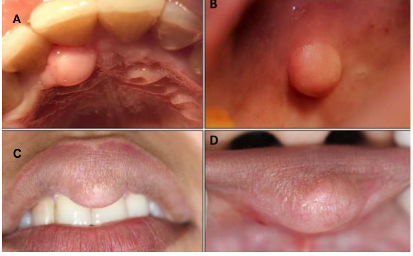
Figura 1 - Características clínicas da MOF