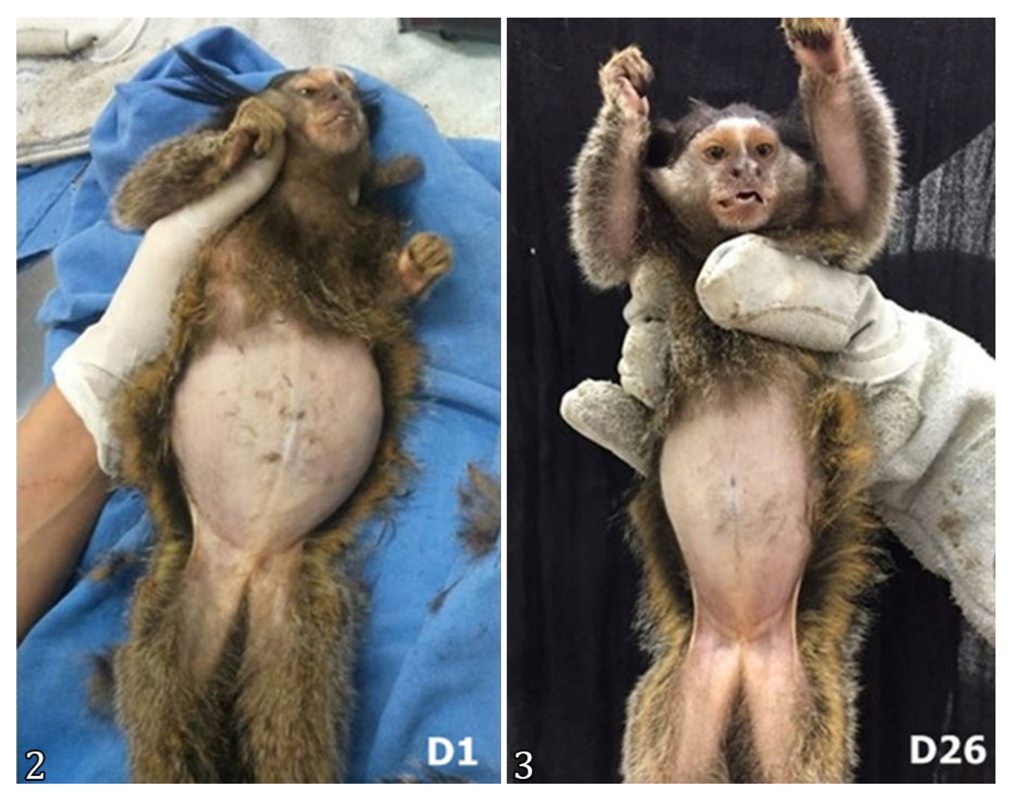
Fig.2-3. Black eared marmoset (Callithrix penicillata). Comparative images of the patient's body condition score on the hospitalization day (D1=4.5/5) and on the day of hospital release (D26=3/5) after dietary intervention and metformin (125mg/animal, PO, q24h) treatment. 2023.

Also, the case herein reported argues in favor of the need for awareness against NPHs and other captive animals' obesity. Before developing overt diabetes, NHPs have a period of obesity-associated insulin resistance that is initially met with compensatory insulin secretion. When a relative or absolute deficiency in pancreatic insulin production occurs, fasting glucose concentrations increase and diabetic signs become apparent (Wagner et al. 2006, Baker & de la Garza 2022). In this way, promoting responsible guard of captive animals regarding maintenance of adequate nutritional and environmental requirements to keep eutrophic condition is mandatory.