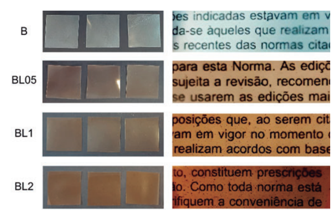
Figure 1 – Samples of the films on black background (left) and on written background (right).

Fig 1 shows a comparison of the visual aspects of the 4 film compositions on different backgrounds. All of the films have good transparency. The color of the films gets darker with the increase of lignin proportion. Some insoluble particles can be visible, with quantity increasing with the increase of lignin content.