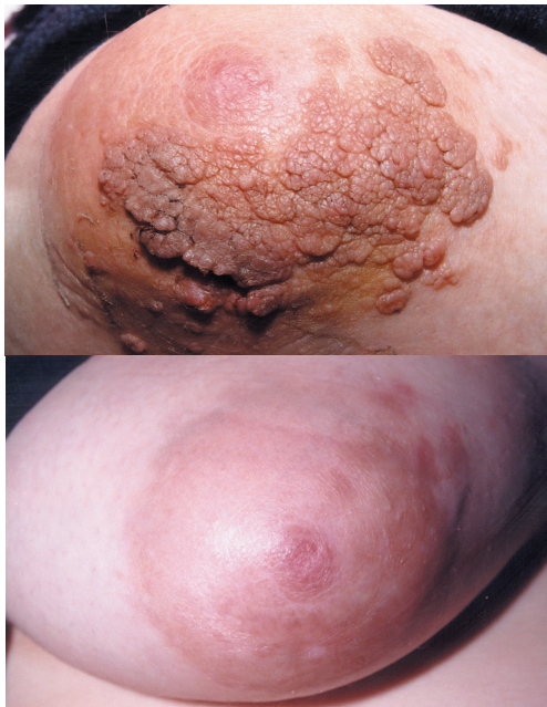
FIGURE 1: A - Epidermal nevus on the areola and surrounding skin. B - Clinical aspect 90 days after shaving and electrocauterization