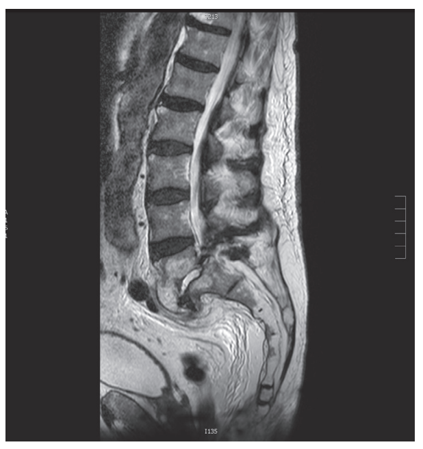
Figure 2: T2-weighted image shows hyperintense signal of the L5-S1 intervertebral disc, which is suggestive of SD. There are associated degenerative changes.