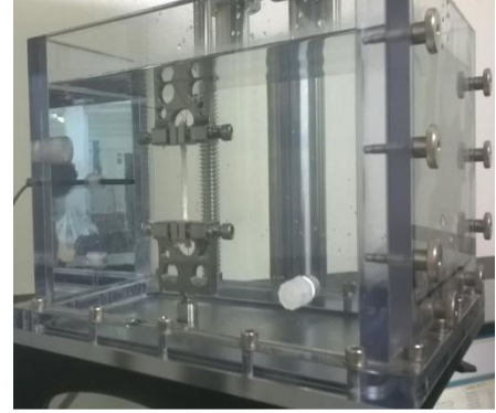
Fig.2 Sample attached to the test machine

Before the testing, preconditioning of the sample was performed. A 50 N preload was imposed for 100 s in order to reach the linear region of the tendon (aligned fibers) [23], seeking consistency with the hypothesis of the implemented model (linearity). After preconditioning, the load is carried to 100 N, and two cycles of loading-unloading are carried out for 10 seconds, with a maximum force peak of 180 N. For this case of study, transversal isotropy was used in the PE and PVE modelsusingan axisymmetric transversal isotropy constitutive matrix. Constitutive characterization of the material parameters was performed using the least squares optimization technique. Displacements obtained in the test were imposed in the numerical model, and the adjustments of the parameters were performed by minimizing the quadratic difference between the numerical and experimental force. Parameters obtained for the PE and PVE models are presented in Table 1 . The comparison of experimental and the numerical force, resulting from the fitting procedure, are presented in Fig.3 .