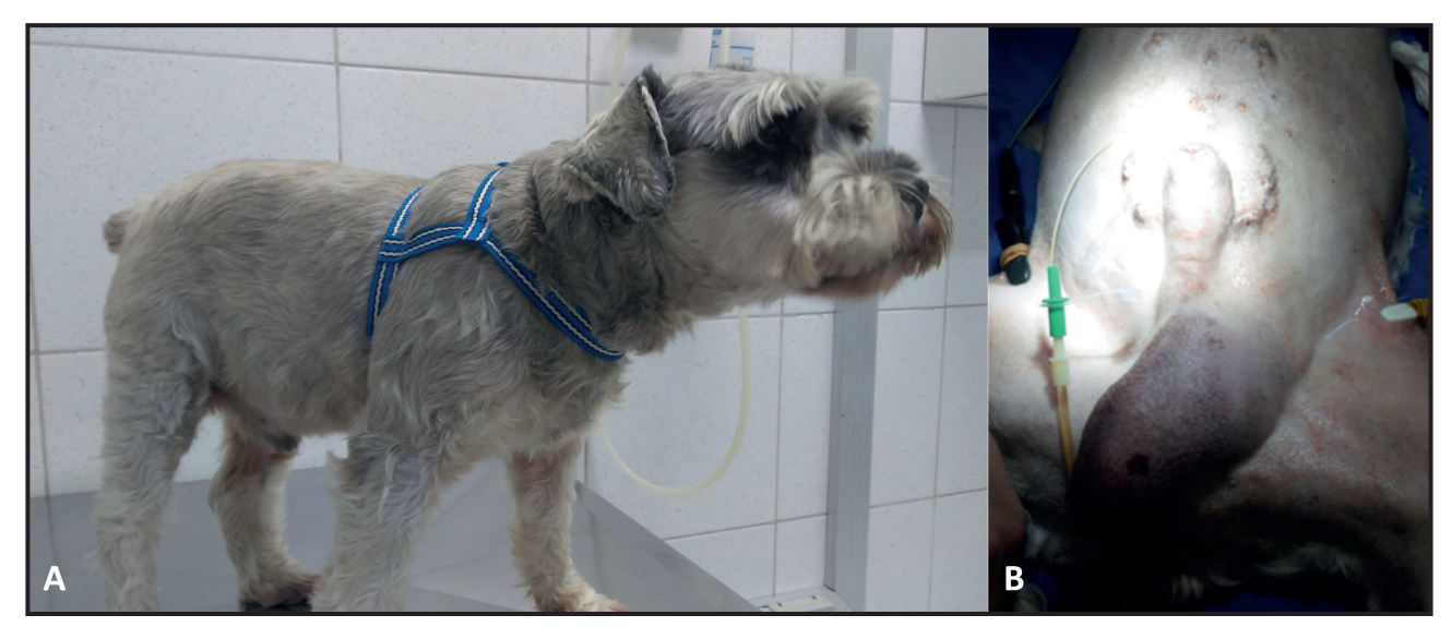
Figure 1. A- Dog's general view. A discrete potbelly appearance is evident due to pyometra and Sertoli cell tumor in the cryptorchidic testicle. B- Presurgical patient's ventral view. The penis is evident, and the scrotum assumed a tubular enlarged format secondary to the left uterine horn filled with purulent secretion passing through the inguinal ring.

A 7-year-old male Miniature Schnauzer weighting 7 kg was brought to veterinary consultation at the Hospital de Clínicas Veterinárias from the Universidade Federal do Rio Grande do Sul due to owner's complain of frequent vomiting, apathy, abdominal algia and progressive scrotal enlargement in the last two months (Figure A&B). The owners also reported that despite entire male, the dog never breeds or had sexual interest for females in the heat. At physical exam the patient showed hypocolored mucosa membranes, reactive popliteal lymph nodes, and 39.7°C rectal temperature. The dog has only one testicle palpable; however, the scrotum was enlarged, increased temperature, and with a tubular format that addressed towards the abdominal left side. The penis was carefully examined, and no abnormalities were documented macroscopically. The blood work (Table 1) showed discrete regenerative anemia associated with anisocytosis, macrocytosis, and hypochromia. Platelets count's was also reduced and there was a left shift leukogram. From the biochemical parameters analyzed only hypoalbuminemia rather hyper total proteinemia was noteworthy [5,17]. At ultrasound examination a tubular image filled by anechoic material extending from the scrotum into caudal abdomen was saw. Moreover, a 6.39 x 8.54 cm heterogeneous mass with mix echogenicity was documented at medial mesogastric region. No other abnormalities in abdominal cavity were reported.