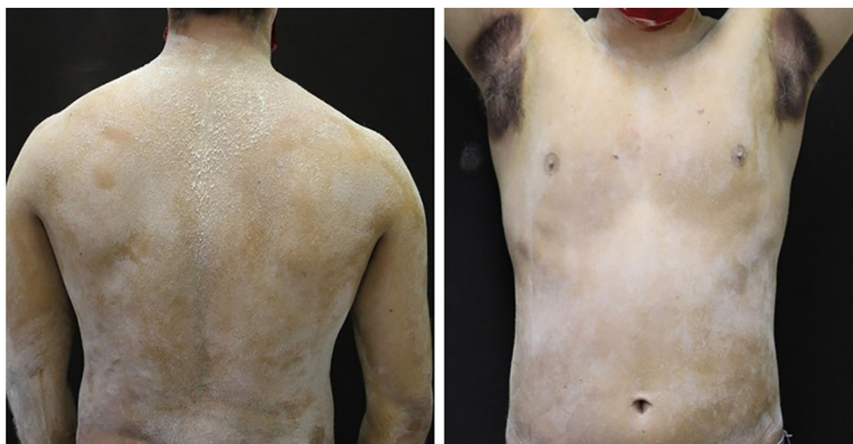
Figure 2 Minor's test demonstrating preserved sweating only in the axillary region after strenuous physical activity.