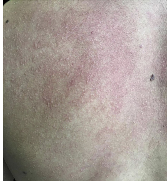
Figure 1 Several normochromic papules and erythema induced by physical activity.

AGIA clinically presents as the absence of sweating after stimulation. The symptoms of heat intolerance and cholinergic urticaria are associated, corroborating the predominance in individuals whose work activity involves exposure to heat. Preserved palmoplantar and axillary